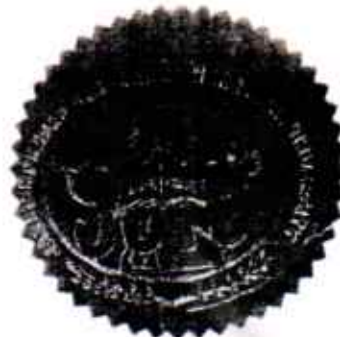
Vice-Chancellor/President कुलपति / अध्यक्ष