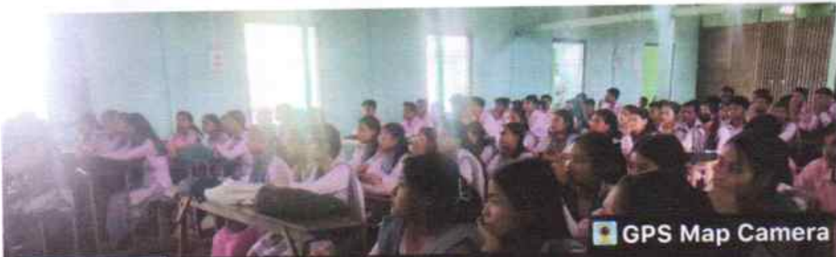
Resource person Delivering speech

Roumari, Assam, India F3R3+Q3H, Roumari, Assam 781313, India Lat 26.491955° Long 91.052907° 28/08/23 12:02 PM GMT +05:30